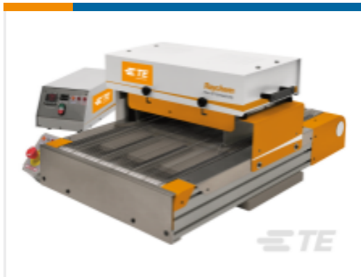
TE Part # 2326489-1 MODEL 105 TUNNEL OVEN, 36" ENTRY, STAND