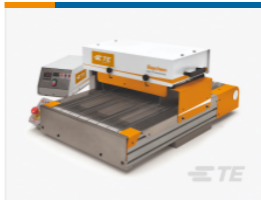
TE Part # 955018-000 CLTEQ-M105-TUNNEL-OVEN