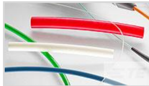
Heat Shrink Tubing