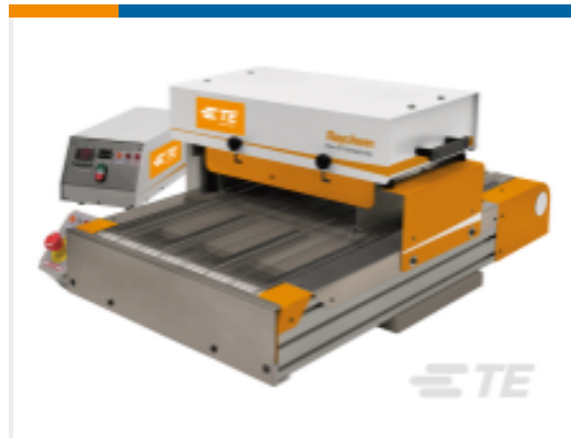
TE Part # 2394980-1 MOD 105 TUN OVEN, 69" ENTRY, STANDARD